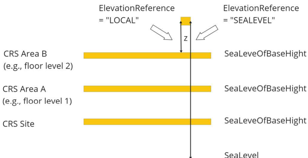
Figure 2: Modelling of the height.

An area can be of kind SITE, BUILDING or AREA_NOT_SPECIFIED. An area of kind AREA_NOT_SPECIFIED can be a virtual boundary (fence) that unlike a SITE or BUILDING is not representing a physical defined region. The main point of an area is to enable capturing entry and exit events of assets entering or leaving an area. An area is therefore an essential concept for location-automation.